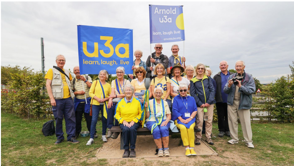
Arnold u3a walkers with beacon and banners at Gedling Country Park

The first 20 minute film shows the handover of the beacon and banner from Mapperley and Carlton & Gedling members to Arnold members at the Methodist Church, Arnold. It then follows Arnold members walking up to and through Gedling Country Park.