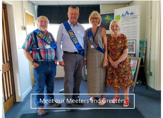
Meet our Meeters and Greeters