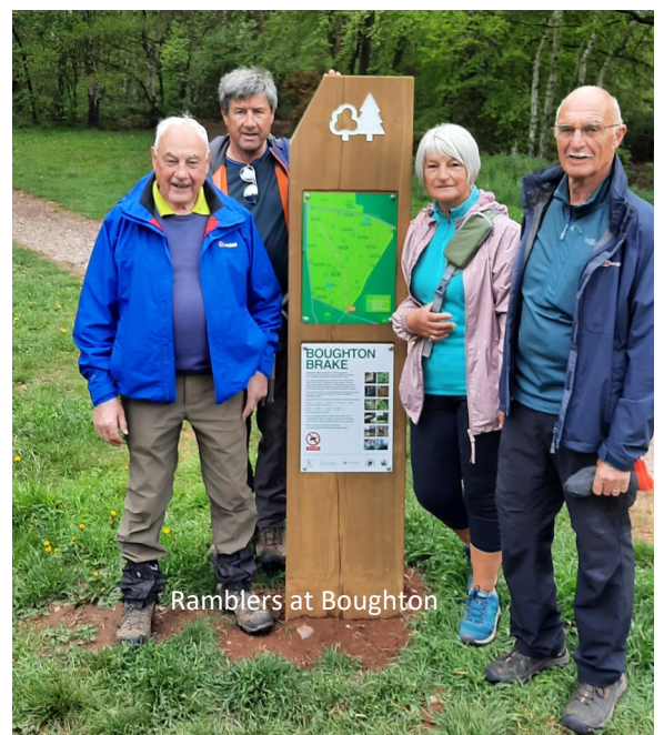
Ramblers at Boughton