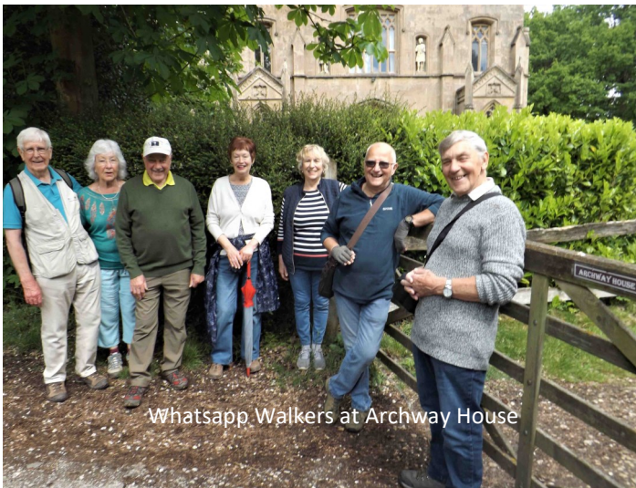
Whatsapp Walkers at Archway House