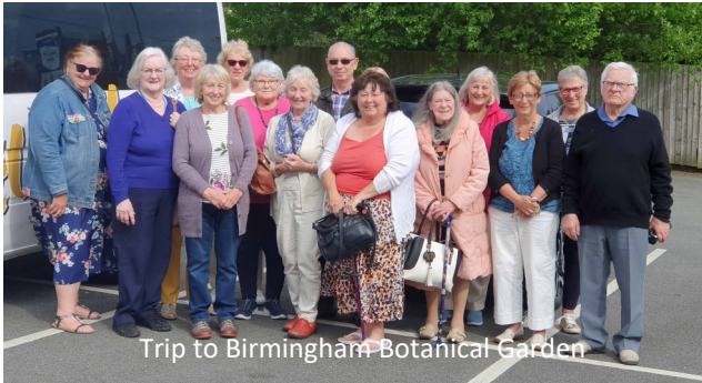
Trip to Birmingham Botanical Garden

Some group news - In May, the All Sorts and Gardening Group had a lovely sunny trip to Birmingham Botanical Gardens followed by a tasty fish and chip supper on the way back. June's trip was to Barnes Dairy Farm near Melton Mowbray where members learned how stilton cheese was made before enjoying a delightful afternoon tea. The Ramblers firstly walked to Conjure Alders via Boughton and secondly along the Northern End of The Five Pits Trail. The Whatsapp Walkers had a pleasant circular walk from Sherwood Forest to Archway House and back. The Photography group this month met to compare their photos on an abstract subject. In addition to